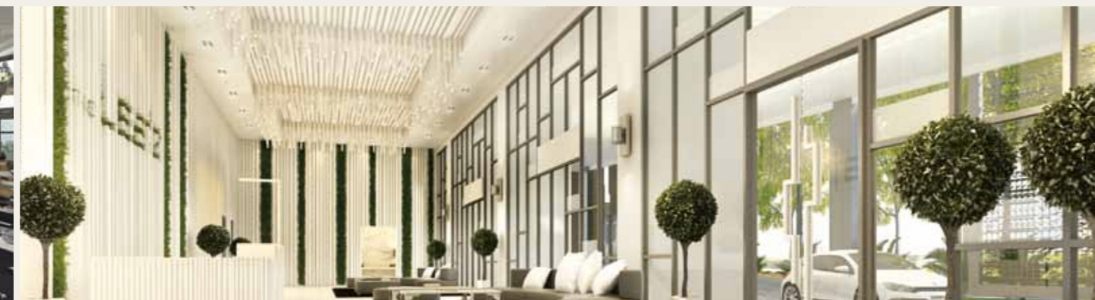
Tower A & B Stellar Lobby