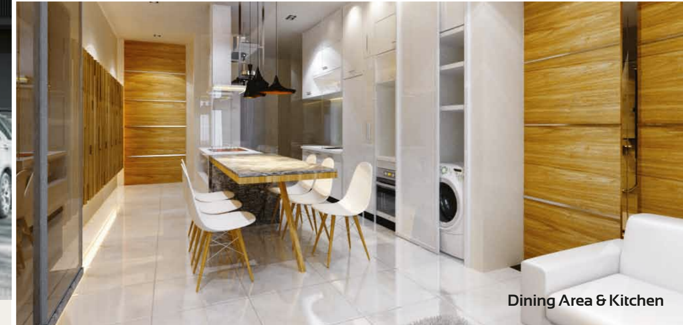
Dining Area & Kitchen

The Leafz maintains minimum doors and walls in each unit permitting flexible space planning. Not only does this maximise the use of space, it also encourages creativity among its residents to plan, improvise and craft living spaces that will serve their every need and desire.